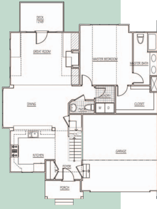
First Floor 1,262 \pm living sq.ft.